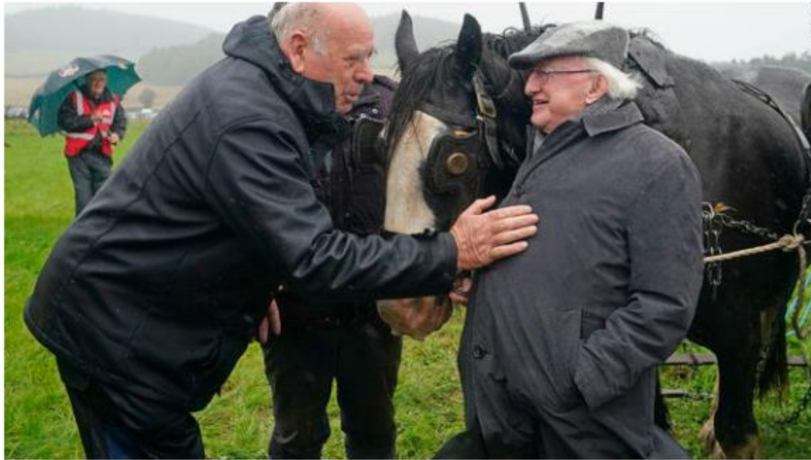
President Michael D Higgins meets competitors at the horse section of the National Ploughing Championships.

While he criticised the organisation at present, he said it would be saved by countries like Ireland, who have 'no other aim or ambition other than to have a safe, sustainable, peaceful world'