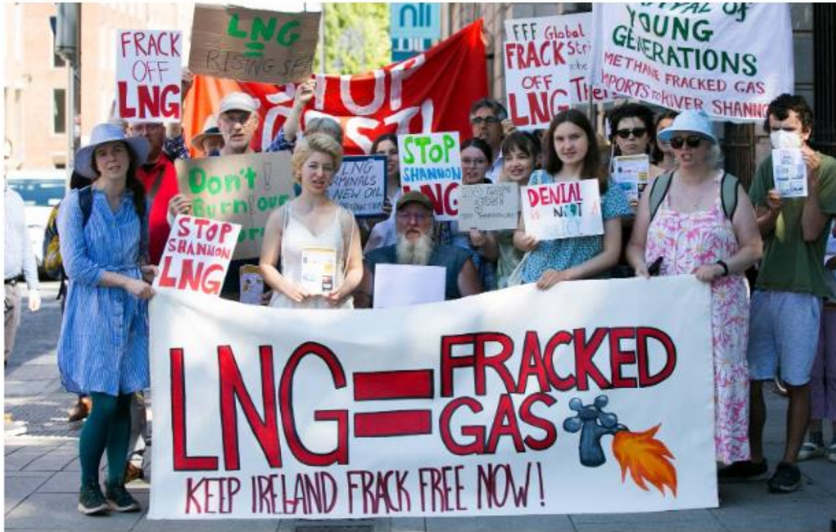
Demonstrators against the Shannon LNG project at a protest in Dublin last year.