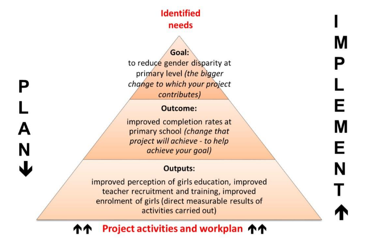
Figure 3: Example of a Weavers Triangle

An example of a Weavers Triangle is presented in figure 3.