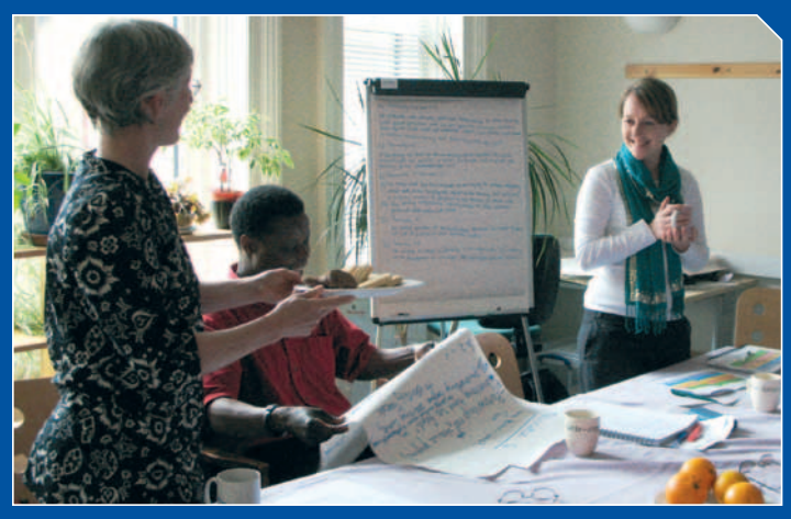
'Developing the self-assessment tool with members', May 2010

consultation process resulting in the production of an effectiveness self-assessment tool targeted at small NGOs. External consultation on the draft tool, involving others with experience in the field, including the Disaster Emergency Committee, One World Trust, Bond and PQASSO, sharpened the approach and a pilot version of the tool was presented at our AGM in September 2010. An online version of the self assessment tool, which includes a platform for networking, discussion and feedback, has been developed to be used alongside the tool itself.